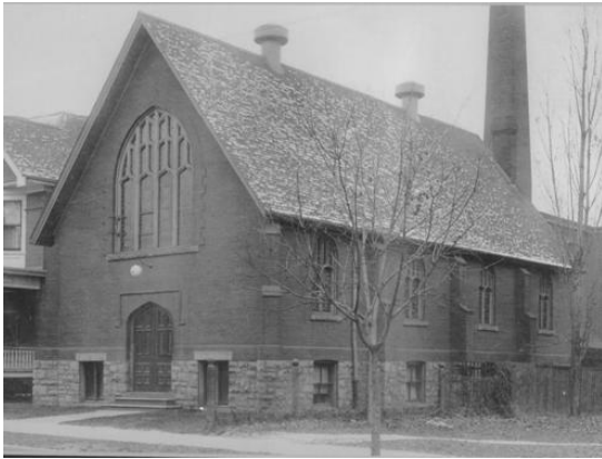
Who am I?